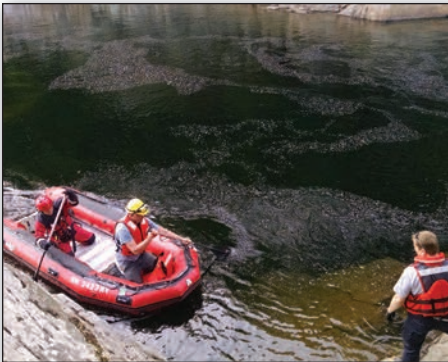
May 24, 2015. Rescue at Livermore Falls.