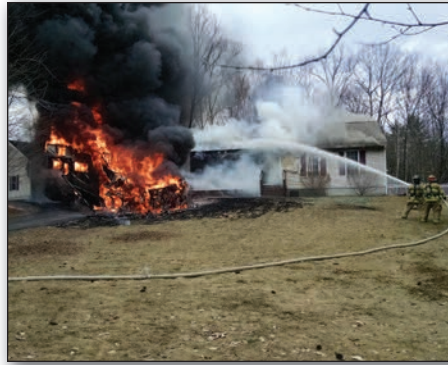
April 18, 2015. Second alarm RV and house fire in Thornton.