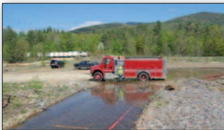
42E3 operates as attack engine.

cer's role and he immediately began assigning tasks to the available resources. The first objective of the drill was establishing a 250 gpm water flow within five minutes of arrival of 42E3 at a simulated building fire using the rural hitch. As the rural hitch was being put into operation, additional resources began the process of establishing a fold-a-tank dump site which eventually