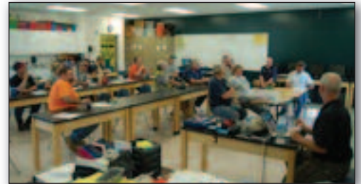
Students discuss various water supply systems.

The seminar, held in Wentworth on a May weekend, began with a morning classroom session reviewing rural water supply operations and discussing the various aspects, strengths, and weaknesses of water delivery systems. After lunch, participants went outside and got busy setting up dump sites and draft/fill sites at different locations in the Wentworth Community. Once the sites were established, the remainder of the after-