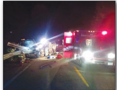
June 17, 2015. Thornton MVC with entrapment.