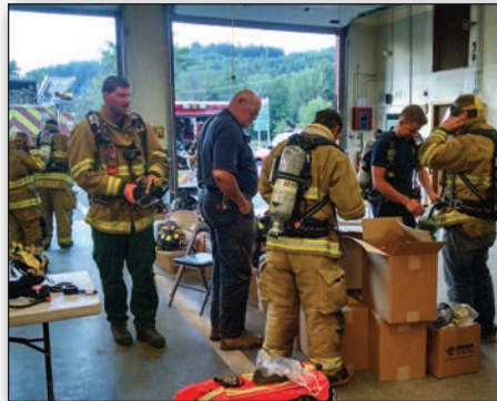
June 11, 2015. Campton-Thornton Fire Dept. Scott SCBA in-service training.