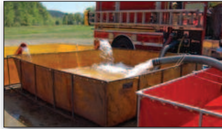
Low profile strainer, jet siphon, and Holly Tubes in operation move water to draft tank.

became the primary water delivery system for the drill. One drop tank was initially set with 42E1 serving as the draft pumper. With not all tankers and engines equipped to quick dump into the tank, both the rural hitch and dump tank operation supplied 42E3. As more resources arrived (response was spaced at somewhat real time) the dump site was expanded to three drop tanks. Water transfer was accomplished by use of jet siphons with hard suction and Holly Tubes. One issue was the lack of low level strainer availability for 42E1 in