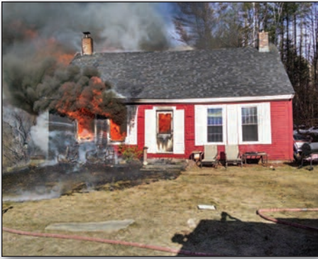
April 16, 2015. Second alarm fire in Thornton.