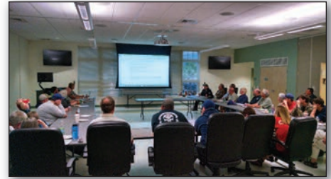
May 11, 2015. Campton-Thornton and Rumney personnel at Campton-Ellsworth Emergency operations plan meeting.