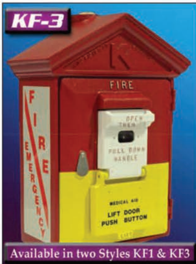
Available in two Styles KF1 & KF3

Need a Fire Alarm Call Box that can be strategically located for special town-municipal functions without the hassle?