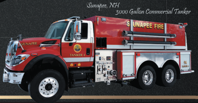
Sunapee, NH 3000 Gallon Commercial Tanker

Greenwood Emergency Vehicles 530 John L. Dietsch Blvd. North Attleboro, MA 02763 www.GreenwoodEV.com (508) 695-7138