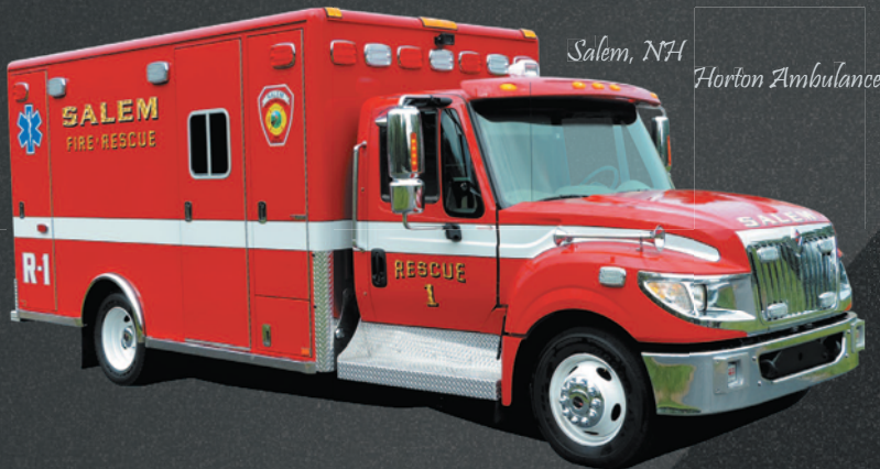
Salem, NH Horton Ambulance