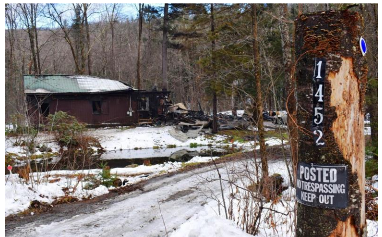
Warren Fatal Fire - December 2, 2018