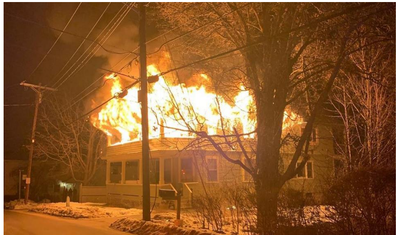
Meredith 2 nd Alarm Fire - November 30, 2018

Then on the evening of December 2 nd the Warren Fire Department was dispatched for a reported building fire. This fire proved very challenging due to its location. Multiple companies responded to this fire, two patients were transported to the hospital, and one subject was found deceased in the building. The NHFMO was called to investigate. 🐾