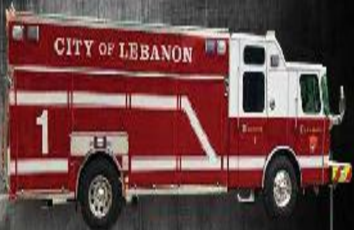
Lebanon, NH Stainless Steel Rescue

Check us both out on Facebook! visit us online for details.