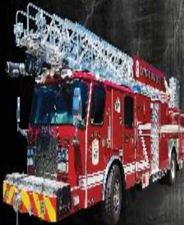
Dover, NH E-One 100' Aerial Ladder

1045 Branson Road St. Albans, VT 05478 www.desorcieemergency.com (802) 527-2216